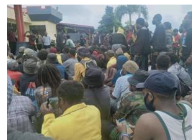
Protesters being detained at the Brimob headquarters in Manokwari

On 25 May 2021, hundreds of people from the Papua Barat province join two public demonstrations in Manokwari, the provincial capital of the Papua Barat. The protesters expressed disagreement with the continuation of the Papuan special autonomy funding. They also demanded the immediate release of all Papuan political prisoners. Joint security forces dispersed the protest - 146 protesters were arrested and temporarily detained. Some protesters reportedly sustained injuries due to excessive use of force by police members during the arrest. The police claimed some protesters violated COVID-19 health protocols.