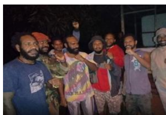
The KNPB activists shortly after being released

The information in this report is collected by local human rights defenders. As human rights defenders face hostile working conditions and legal aid services lack remote areas, this compilation of cases cannot be regarded as complete.