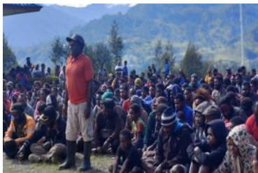
IDPs seeking shelter in Puncak's largest town, Kimak

Information published by human rights observers and local media outlets indicates a lack of commitment from the local governments towards the IDPs in the Papuan regencies Nduga, Intan Jaya and Puncak. Particularly, the IDPs from Nduga already have to live under these uncertain conditions for more than two years, without access to adequate healthcare, education and humanitarian government services.