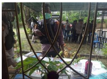
Armed police officer during the book launch at P3W in Jayapura